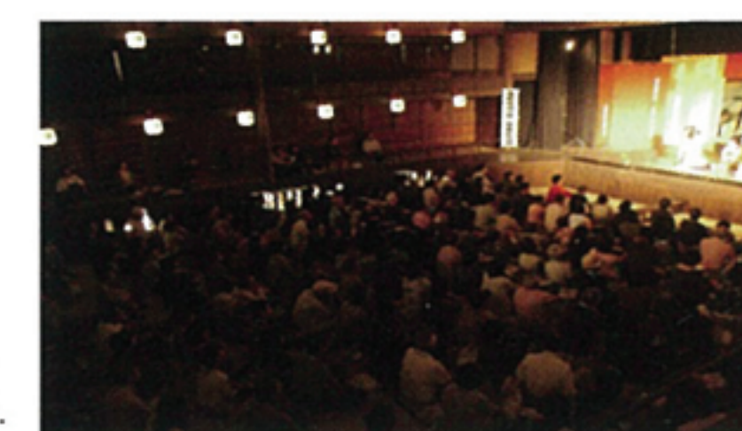
A theater used even now for Kabuki performances.

This theater building was constructed in 1887 next to the Hirose river that flows through the town of Yanagawa, and it was used for plays. Situated in the center of the stage is a revolving stage. Housed under the floor of the revolving stage is the equipment to operate this operating devices. The theater building was equipped with all of the other necessary facilities. Behind the stage were rooms used by the performers, and their graffiti remains on the walls of these rooms. As only a few older theater buildings of this type remain in the country, the Hirose-za Theater is one of the oldest of its kind, and therefore is an important historical building.