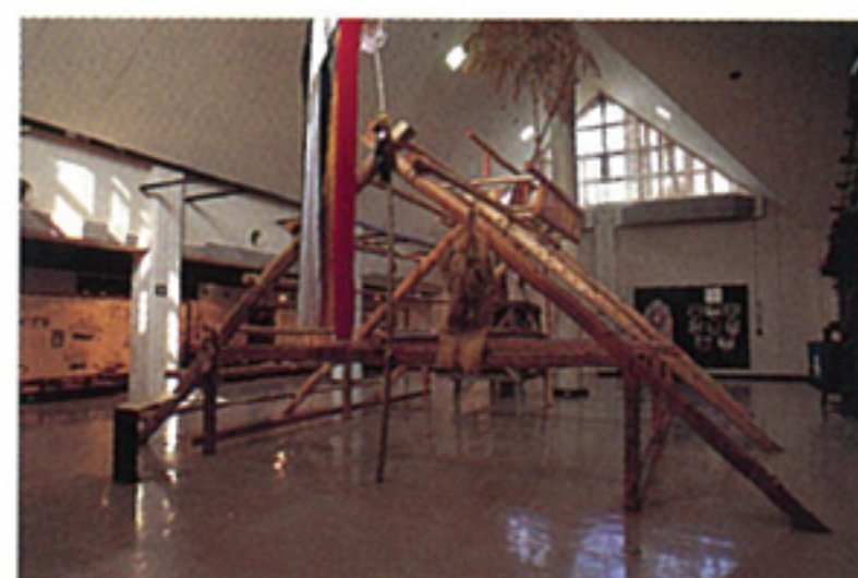
Interior of exhibition pavilion

With the aim of passing on every-day skills, you can learn how to create mats, sandals, and other items out of straw, and enjoy old-fashioned play.